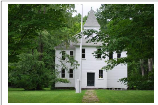
2015 school building today as a residence.

In 1939 when the Colchester Township School consolidated, students from the Cooks Falls schools were sent to the Roscoe Central School.