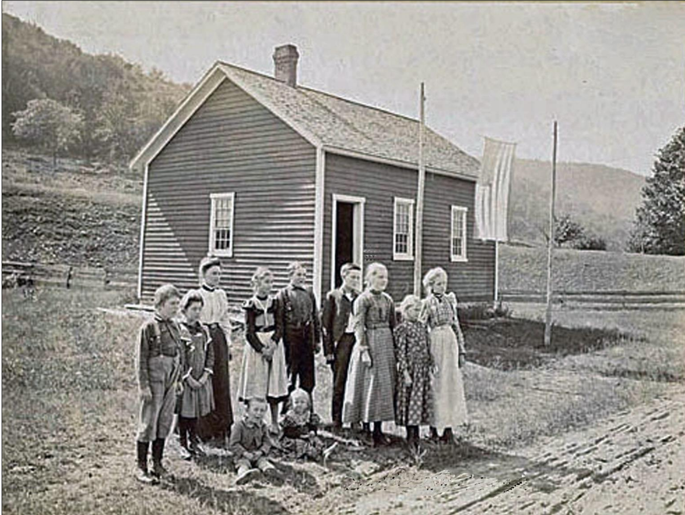
Brock Mountain School in late 1880's.