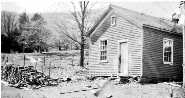
Miller Hollow School #7

Located in the hamlet of Pepacton, the first school commissioner report for this school was filed in 1854 and the school remained open until the Colchester Schools' consolidation in 1938. The school house was purchased by the Pepacton Grange No. 1407 and they used the building for their meeting place until March 18, 1948 when the Board of Water Supply took possession of the building. The school house was demolished in the construction of the Pepacton Reservoir. The other school located in Pepacton was the Miller Hollow School #7; this school house was also taken in the Pepacton Reservoir construction along with Coles Clove School #8.