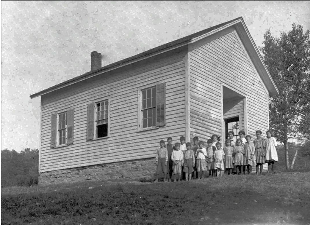
Pepacton School was referred to as the "big school". School group circa 1900.