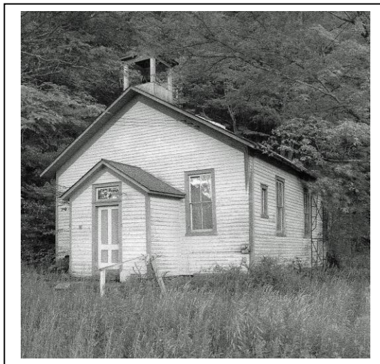
Harvard School House 2015

Both of these schools were incorporated into the Colchester Township School Consolidation of Common Schools in 1938, with their students going to the new Central School in Downsview.